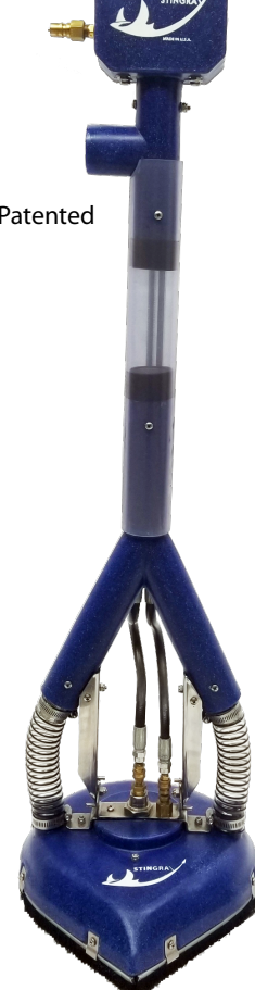
Two rotating jets and one corner jet

CAUTION: Do not use flammable and volatile material.