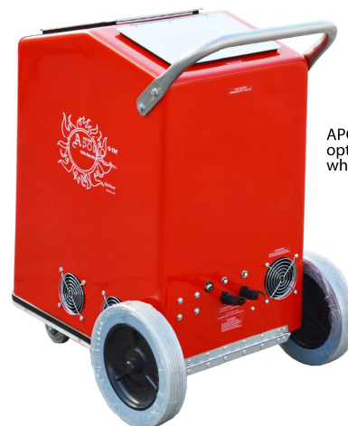
APOLLO-94 with optional 10" rear wheels

Picture shown with standard accessories: (1) 15' vac hose & 15' sol hose. (1) single jet, 12", Autoseal Wand with adjustable stainless steel grip handle. Optional: (2) 10" rear wheels