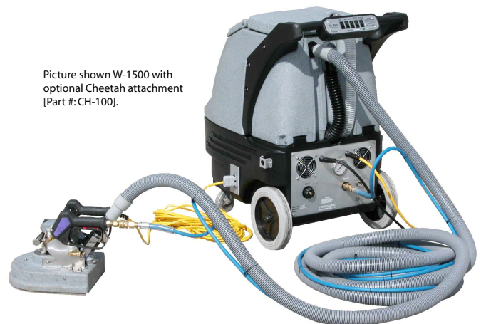
Picture shown W-1500 with optional Cheetah attachment [Part #:CH-100].