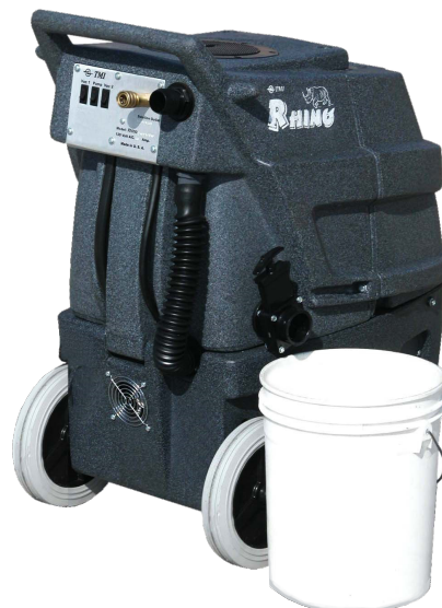
Picture shown with optional drain valve