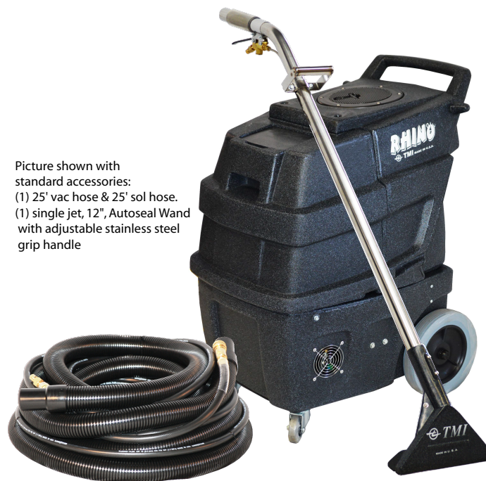
Picture shown with standard accessories: (1) 25' vac hose & 25' sol hose. (1) single jet, 12", Autoseal Wand with adjustable stainless steel grip handle