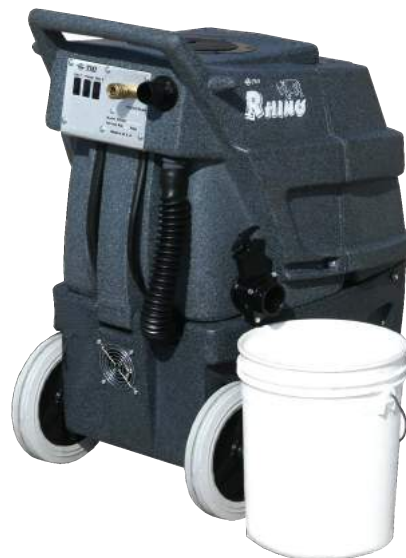
Picture shown with optional drain valve