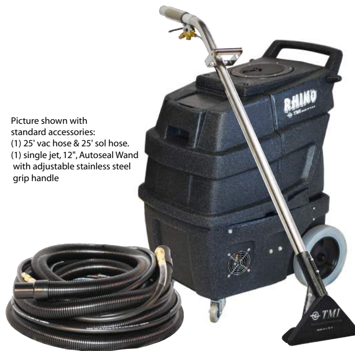
Picture shown with standard accessories: (1) 25' vac hose & 25' sol hose. (1) single jet, 12", Autoseal Wand with adjustable stainless steel grip handle